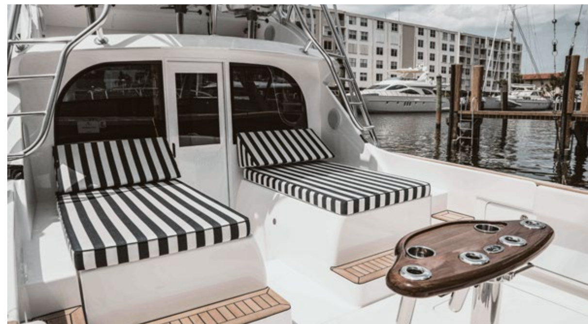
Blue and white exterior upholstery package shown above.