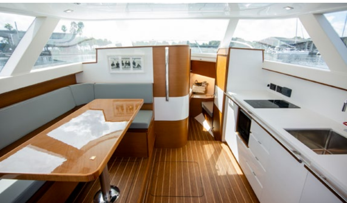
Gray interior package shown above.